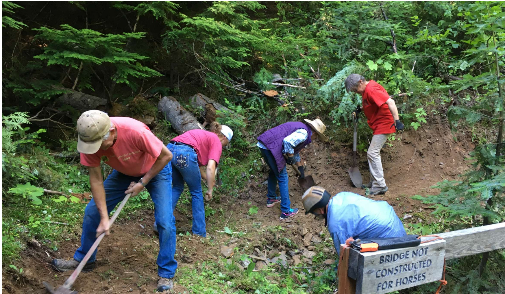
PBCH members dig out around the bridges on the snowshoe trail Jeannette's Jaunt last month at 4 th of July Rec Area.